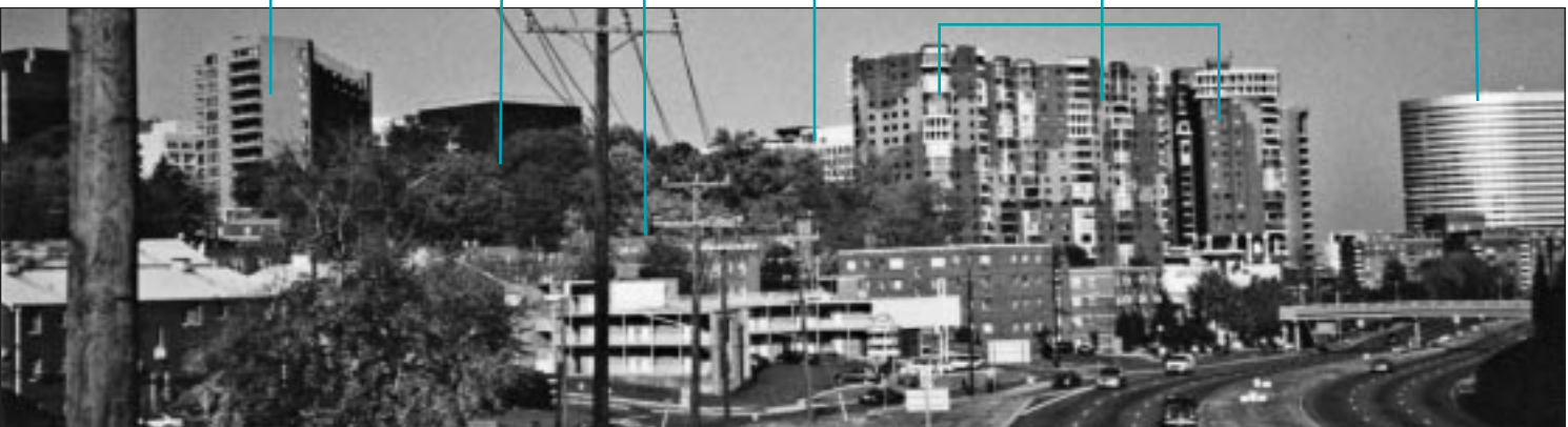
CURRENT VIEW FROM RHODES STREET BRIDGE OVER ARLINGTON BOULEVARD. The Oakwood Apartments, The Belvedere and 1000 Wilson Boulevard now dominate the view of Rosslyn from Arlington Boulevard. The proposed Rosslyn Ridge apartment building would be as tall as the Oakwood Apartments and The Belvedere Condominium.