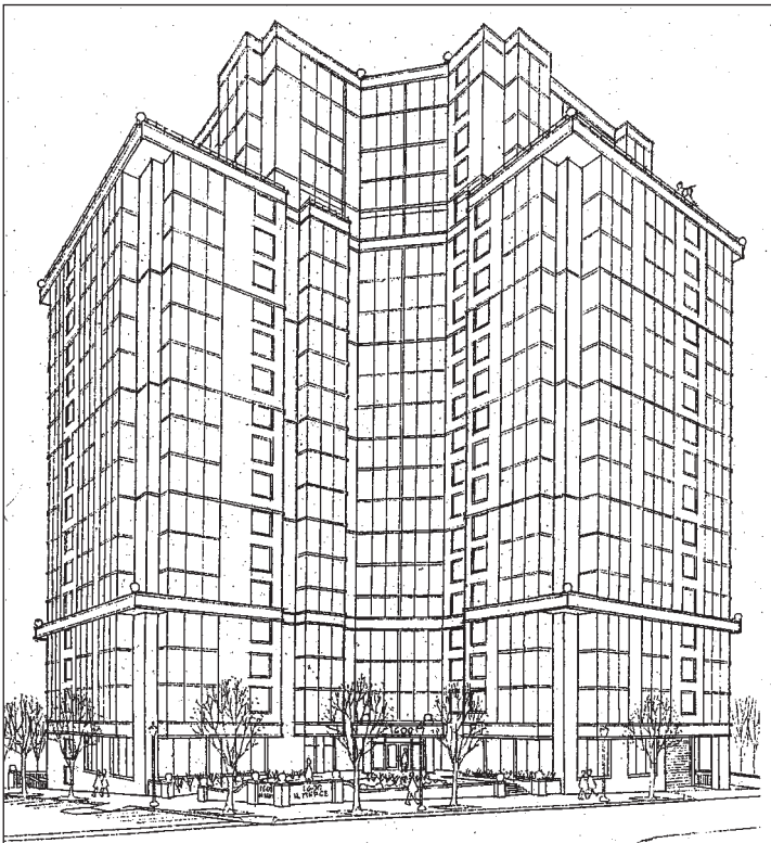
PROPOSED ROSSLYN RIDGE PROJECT. Arlington Partners for Affordable Housing (APAH) and Paradigm Development Company are working to develop a 267-unit project with a 50/50 split of market-rate and affordable units.