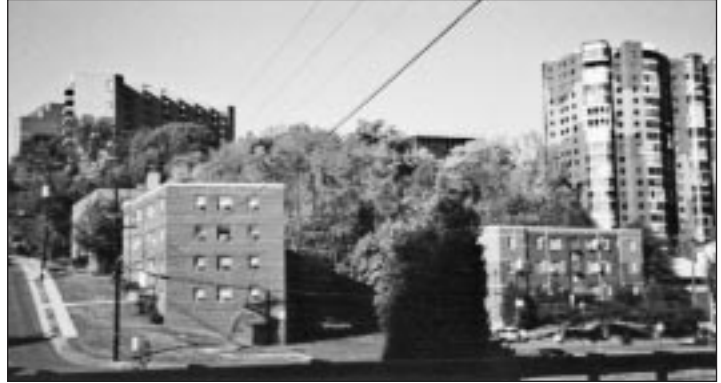
CURRENT VIEW FROM FORT MYER HEIGHTS. The Rosslyn Ridge Apartments (at left, second building up the hill) are just south of Hillside Park. APAH proposes using density from Hillside Park to achieve its affordable housing objectives.

The 16th Street extension that runs between Rosslyn Ridge and Hillside Park serves as an entry road to one of the Belvedere's garages. The Belvedere has a perpetual ease-