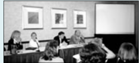
ULI Panel met at the Hyatt Arlington June 19-22.