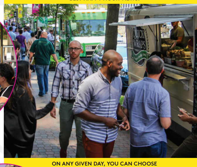
FROM UP TO 10 FOOD TRUCKS.